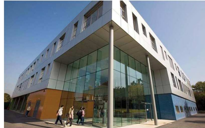
Chessington Community College Royal Borough of Kingston