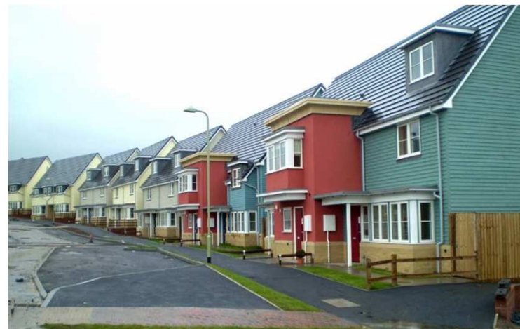
Rocks Green, Shropshire 91 house new build community heating