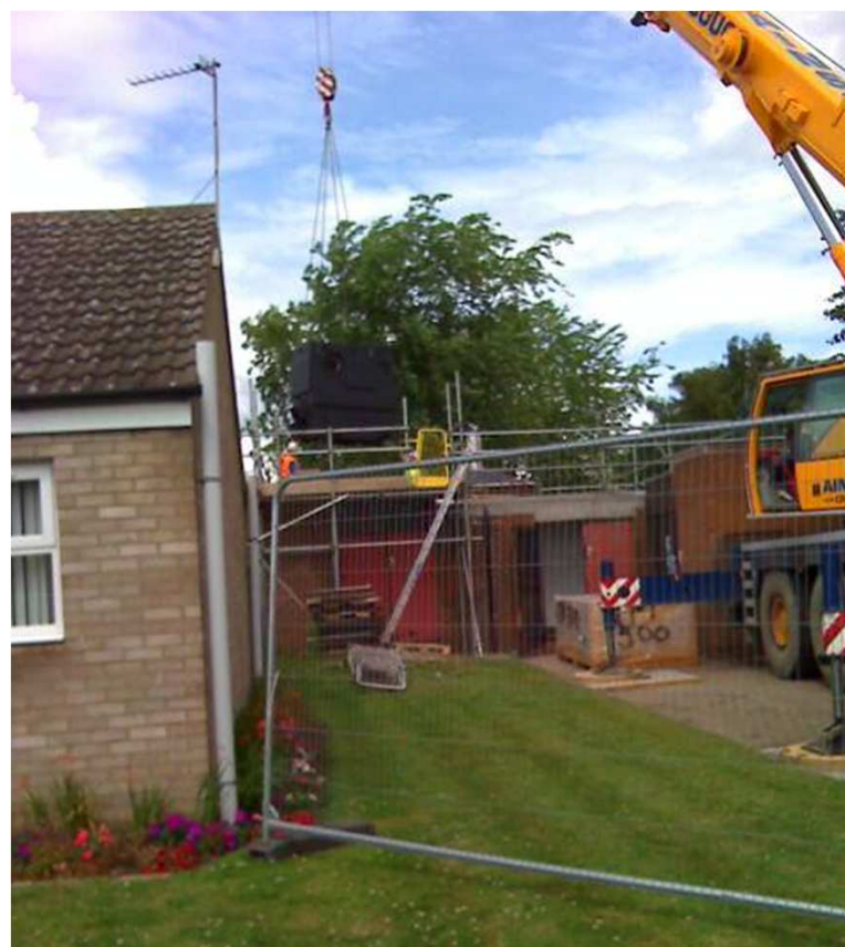
Froling 500KW boiler delivery into retrofit energy centre